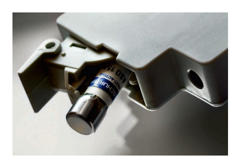
Fig. 2: ASO solarfuse and FSO fuseholder for PV systems

As industry standards are shifting and 1000 VDC protection is becoming more common, SCHURTER continues to develop fuses and fuseholders that meet this requirement at both high and low amperages. The quick-acting ASO line fuses ( 10 \times 38 \text{ mm} ) 3 are UL-recognized. They are designed for DC applications of up to 1000 VDC and are capable of safely breaking nominal currents of up to 30 A, making them perfectly suitable for short circuit protection in the individual lines of PV systems. The FSO matching touch-proof fuseholder 3 is designed for DIN rail assembly and therefore perfectly suitable for use in junction boxes.