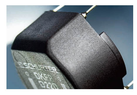
Fig. 4: DKFP current-compensated choke

Linear chokes 10 | such as DLF are used for smoothing out output voltage fluctuations in step-up/-down transformers, while currentcompensated chokes such as DKFP are used for attenuating electromagnetic interference in auxiliary power supplies.